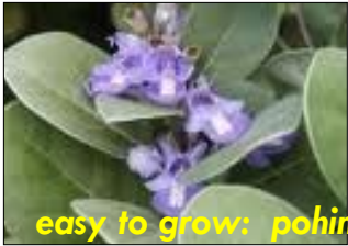
easy to grow: pohinahina (left) & akia (right)