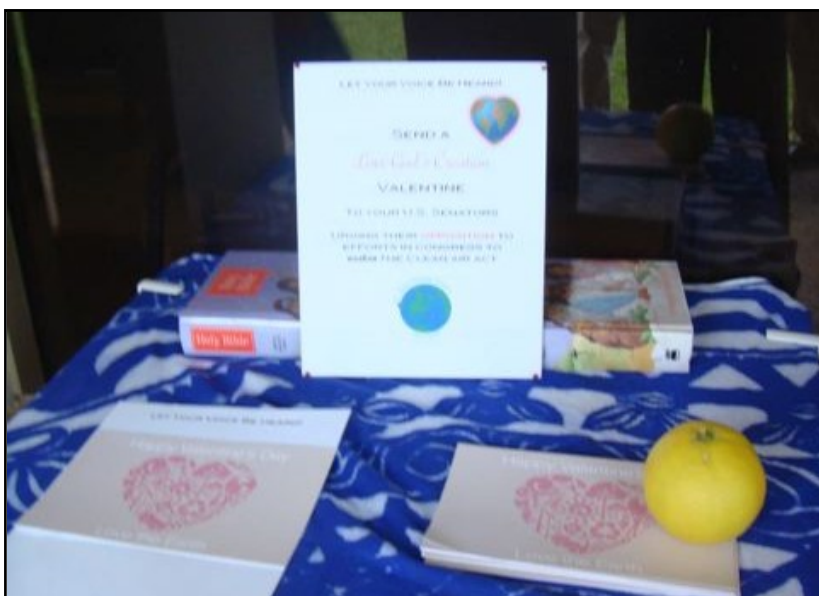
"Green" opportunity —On Sunday, 2/5, Valentine cards were available for sending to Senators; the message urged them to oppose efforts to roll back the Clean Air Act.