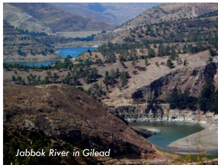
Jabbok River in Gilead

This sermon series will continue through March 16th when CCU will meet following worship to embrace the congregationally developed long and short term plan for the rebirth and growth of CCU .