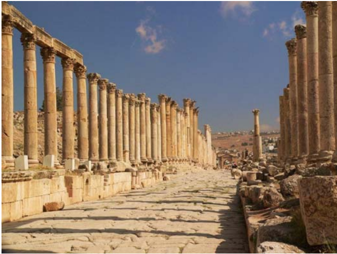
Jerash, 1st century Roman city north of Amman, Jordan