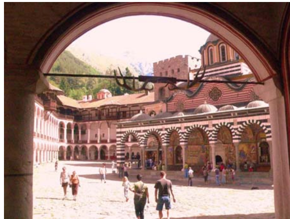
Rila monastery, founded 10th century, Bulgaria